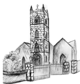
Church of St. John the Baptist, Knock