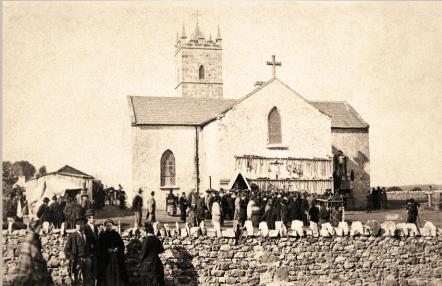
Image: Apparition Gable, Knock c.1880.

Whether you are coming to Knock as a seasoned pilgrim or a stranger to this place, you will find a unique and prayerful place with a completely unique and fascinating history.